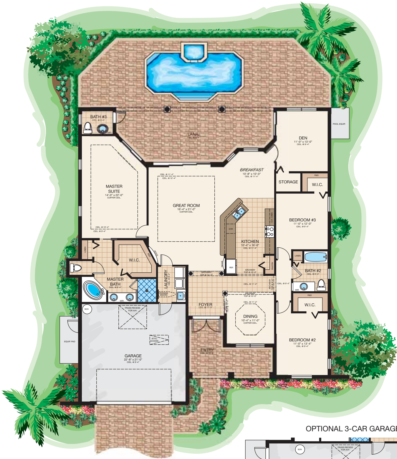
OPTIONAL 3-CAR GARAGE